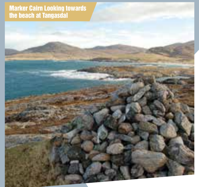
Marker Cairn Looking towards the beach at Tangasdal

This is an established trail with way-marker posts. It has a combination of cultural and natural heritage which gives a great insight to the island's past and present. It has also some truly spectacular scenery."